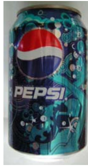
BOSNIA-HERZEGOVINA SM GROOVY (Choreography can) (Chris)