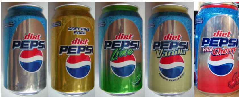
USA New "Silver Arch" logo Diet cans