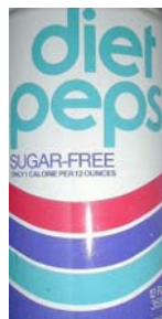
Waves (red, d.blue, l.blue)