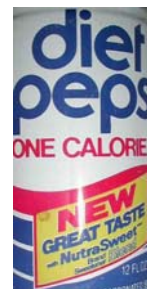
Waves (red, 2 dark blue)