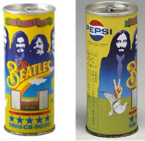
JAPAN: 70's "The Beatles" can (sold at 500 US$, 11 bids)