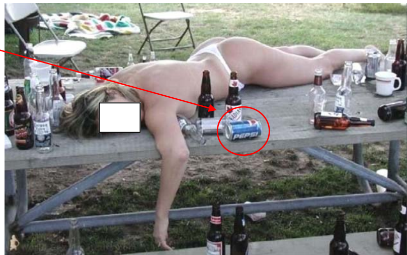
She got drunk because of this! (picture found on the internet, unknown person)