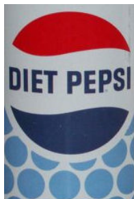
Blue dots bottom