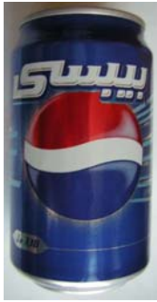
ALGERIA (2006) Production of this can was managed by the Italian branch of Crown-Cork & Seal. A Diet (or Light) can should be also available