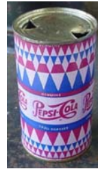
Sold at: 30.99 US$ Bids: 2