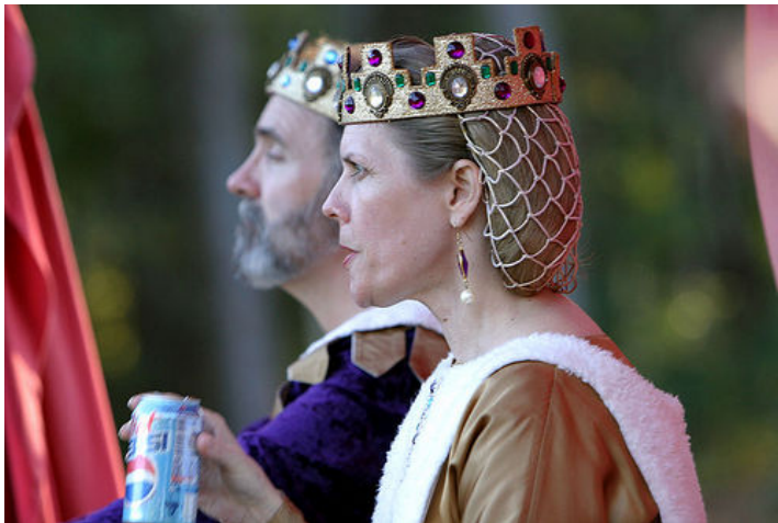
Pepsi: queen of soft-drinks or soft-drink for queens?