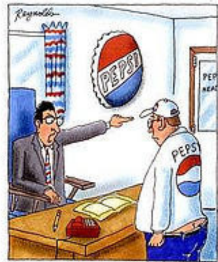
"You're fired, Jack. The lab results just came back, and you tested positive for Coke."