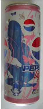
FRANCE Slim 250ml Light and its advertisement (Chris)