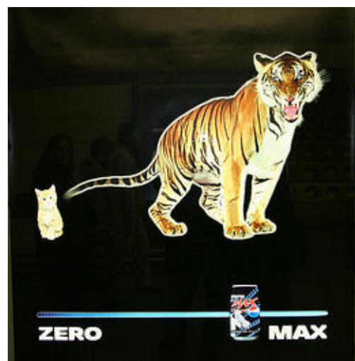
Advertisements for Pepsi Max (against Coke Zero)