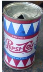
Sold at: 24.99 US$ Bids: 1