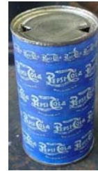
Sold at: 24.99 US$ Bids: 1