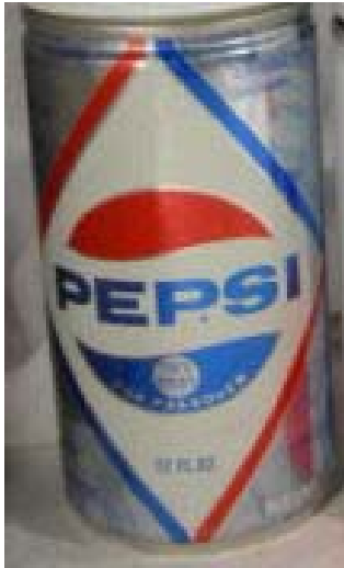
USA , 1966 Diamond Face, aluminum For Passover can, unknown before, sold at 1259.56US$