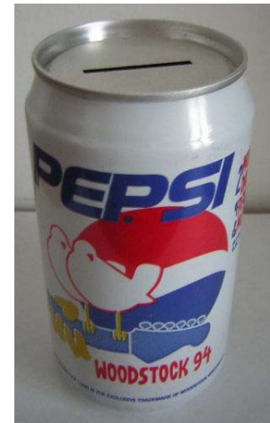
USA , 1994 Woodstock bank can. Only 50 made. 2 pieces sold in the same auction.