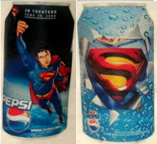
While Diet is, at the end, very similar to the original artwork, we lost a beautiful reg. can with a full body picture of Superman, replaced in the final version by the new "S" 3D logo. (original artwork from Pepsi)