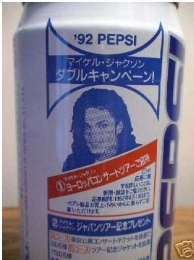
JAPAN , 1992 Michael Jackson Tour, 206 neck. Sold at 76.00 US$. Was known before only in the ribbed neck version (right).