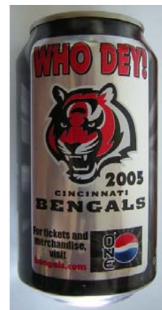
USA The only known Pepsi One black can special issue can (Chris)