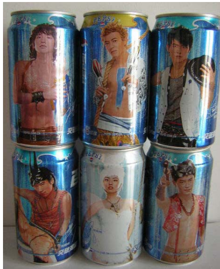
CHINA Pepsi Circus 6 can set (Walter)